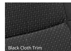
Black Cloth Trim