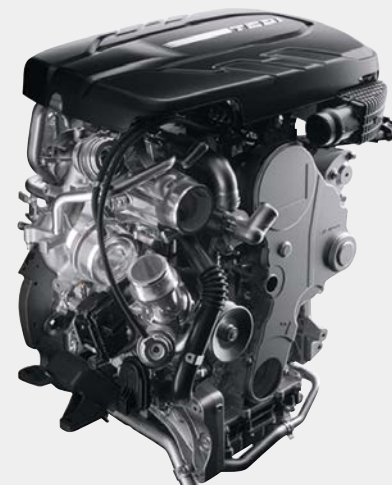
2.0 litre D20 turbo diesel