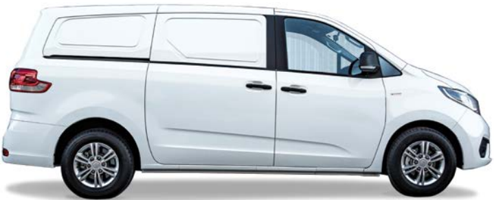
5168mm Payload (kg) 1 : Petrol 1039 / Diesel 1015