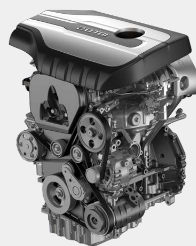
2 litre petrol engine