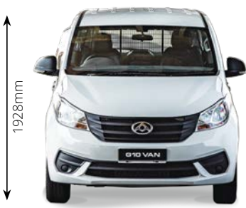
1928mm 1980mm (Mirrors Extended)